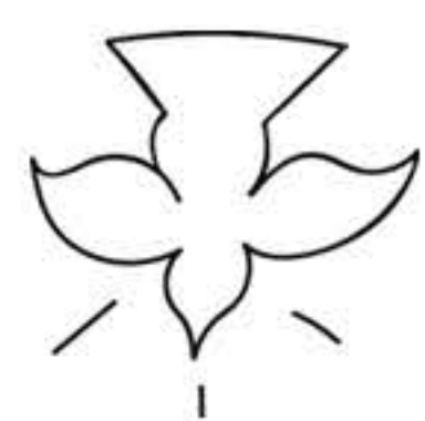
The Holy Spirit